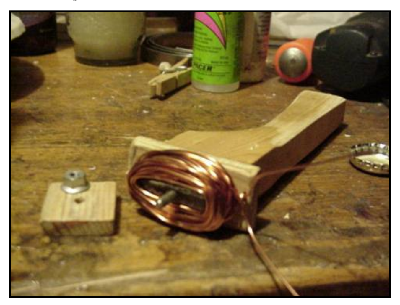
Above is shown the same coil winder with a finished coil on it. Each coil is made up of 40 turns of AWG 18 magnet wire. Once the coils are finished, I twisted the ends tightly together before removing them from the winder.