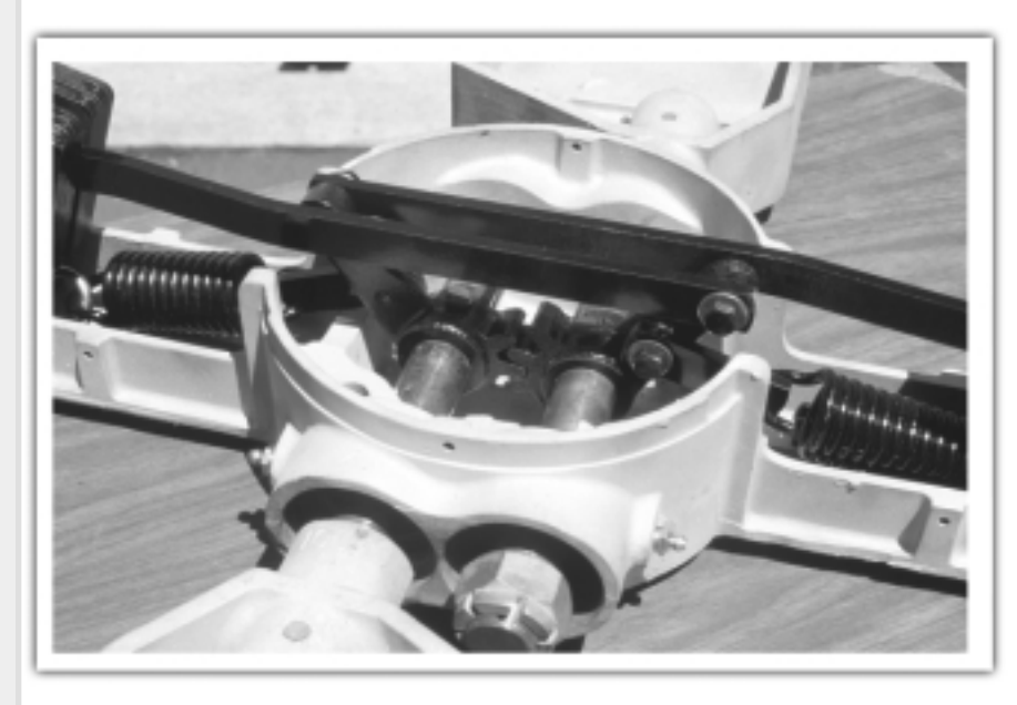
(Above) At rated speed, the governor's weights arc outward, pulling the gears and prop shafts into rotation, preventing rotor overspeed.

The alternator's shaft was considerably shorter than the original generator shaft. I came up with an extension to ensure proper alignment of the pinion and drive gears. To accomplish this, I machined a piece of steel bar stock on a lathe to an inside thread on one end to