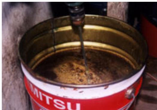
"Cooking" biodiesel on the kitchen stove.

Vegetable oils and animal fats are triglycerides, containing 7-13% glycerine. The biodiesel process turns the oils into esters, separating out the glycerine. The glycerine sinks to the bottom and the biodiesel floats on top and can be syphoned off.