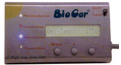
The BioCar computer