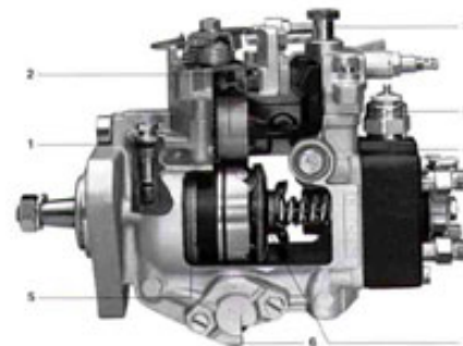
Cutaway view of an injector pump -- complex, expensive

That done, get a good system matched to the right kind of engine with the right kind of