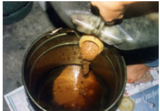
Used cooking oil from McDonald's.

We'd also bought 10 litres of the cheapest new cooking oil we could find -- we don't know what kind of oil it was, the tins only said "Cooking Oil" -- and used this for our first experiment.