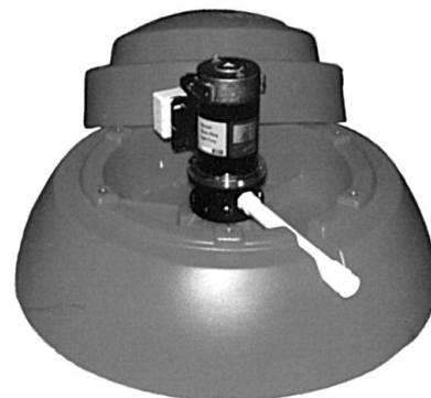
This floating pump consists of a Mono Sunray pump mounted on a floating pontoon.

A third method is to use a wind turbine to compress air, which can then be used to drive a pump of some sort. Two examples of home-built pumps of this type appeared in issue 66 of ReNew .