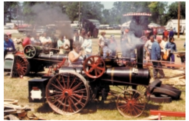
One-half-scale steam tractor

Using 47 lbs of steam per horsepower hour to be consumed by our engine,