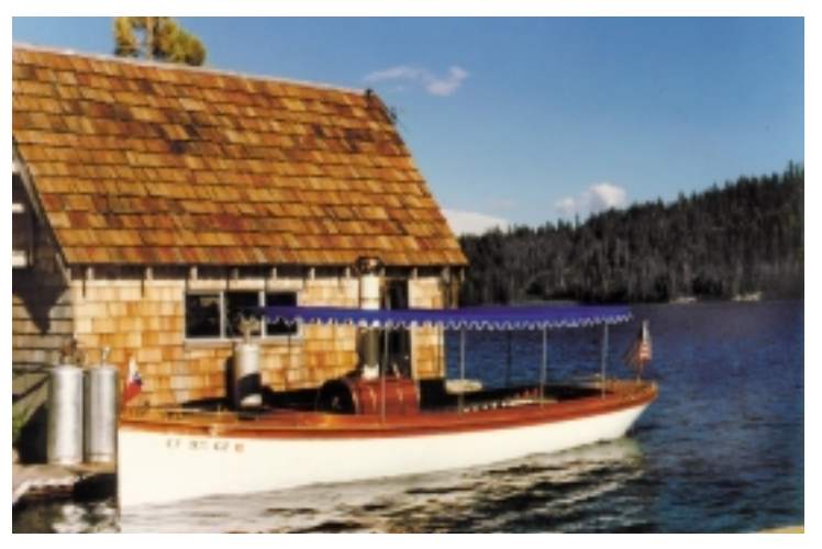
Steam launch Santa Cruz II, Echo Lake, California

engines produce enormous torque at almost any rpm. You can figure this torque by taking the square inches of the piston, multiplying that by the average cylinder pressure, and multiplying that figure by the length of the stroke measured in feet divided by 2. An example would be: A single cylinder engine has a bore of 3 inches and a stroke of 4 inches and runs at 100 lbs of average cylinder or "mean" pressure. A three-inch piston has