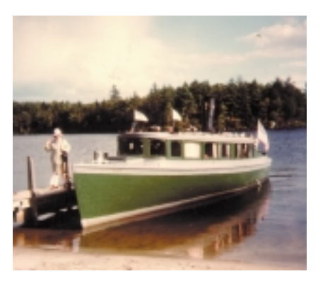
A bigger steamboat

approximately 7 square inches (3 \times 3 \times .7854) and a stroke of .33 feet. (4/12). 7 x .33 = 2.31. Times that by 100 pounds pressure x 2.31 = 231 and divide that by 2, and you get 115.5 foot-pounds of torque. In reality, however, there are friction and efficiency losses.