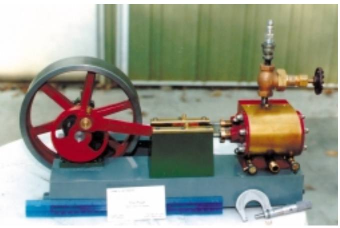
One of the small, high-quality steam engines made by the author's company, Tiny Power, Inc.

Turbines are nice, and I have one myself, but in home scale sizes, they are very inefficient. It's just a matter of physics and costs. I know there are plenty of folks out there that will argue this point, but if they can come up with an efficient, home-scale turbine and sell it at a reasonable cost, I'll buy it.