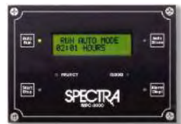
MPC 3000 Controller