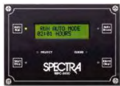
MPC 3000 Controller

Part # Volts SPE#NEW1000 24/120/240-volt