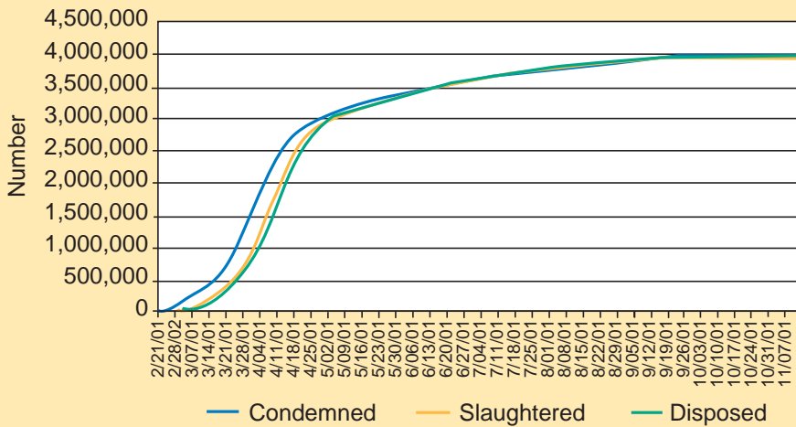
Figure 1. Cumulative Number of Animals Condemned, Slaughtered, and Disposed of During the 2001 FMD Outbreak in the UK

in place during the 1967 outbreak and placed major limitations to on-farm burial in many areas. Public health officials, the public, and the media raised concerns regarding the potential contamination of ground water from on-farm burial and air quality issues from pyres. While these concerns were being voiced, the outbreak continued to escalate. Carcass disposal could not keep pace with the rate that infected and exposed animals were being killed and farmers coped with the trauma of seeing the carcasses of their livestock for days, or in some cases weeks, prior to disposal (see Table 1). Officials needed to quickly develop alternative disposal options. These options included rendering, use of licensed commercial landfill sites, and the creation of mass burial sites – all new strategies for carcass disposal developed in the face of an escalating outbreak (see Figure 2).