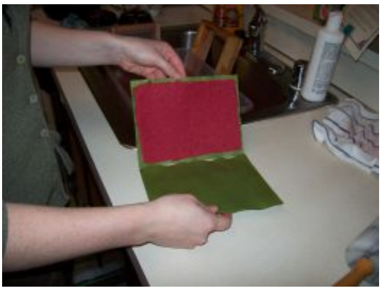
Step 8: Flip the pulp and blotter over onto a dry blotter page.

Click thumbnail to view full-size Step-by-Step Photos for Steps 8-9