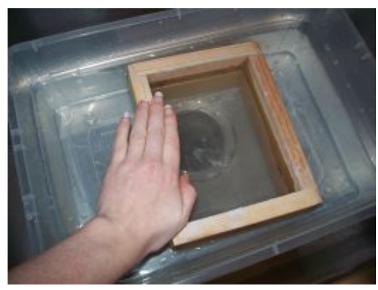
Step 4: Hold the deckle in the water with one hand.