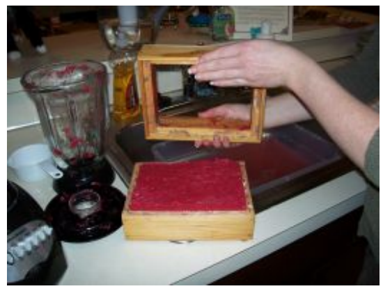
Step 6: Remove the top of the deckle.

Click thumbnail to view full-size Step-by-Step Photos for Steps 6-7