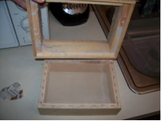
Step 1: See the two parts of the deckle, the larger part is the top.