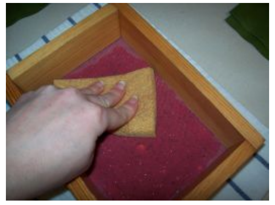
Step 7: Use the sponge on the screen to remove excess water.

Click thumbnail to view full-size Step-by-Step Photos for Steps 8-9