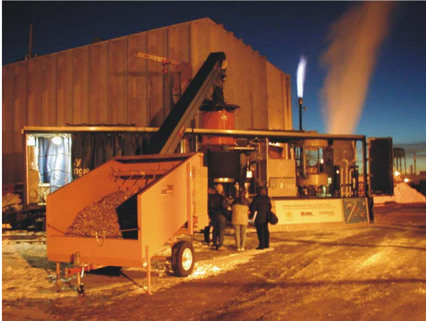
Figure 1. Portable gasification system in operation at the EERC.