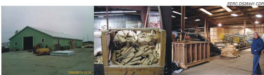
Figure 5. Project site.

data through the last quarter of 2007. The Grand Forks Truss Company, the building products manufacturer providing the wood waste for this project, will continue commercial operation of the process in the future.