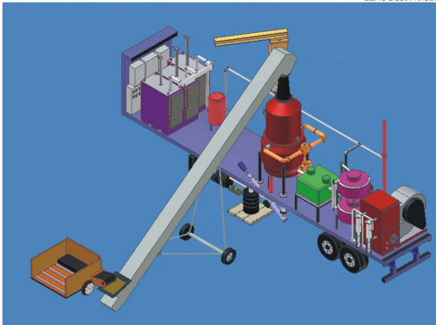
Figure 2. Portable gasification system and fuel.