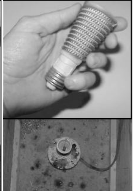
Left: The dryer cabinet and the polycarbonate trays. Right: The 600-watt ceramic heat coil screws into an ordinary porcelain lamp base.

Whatever the size or material of your trays, design the cabinet size around them allowing for sufficient room below for the heat element and room to easily fit the trays within. I am providing the measurements below to serve only as a guide for your own construction process, because the type and size of trays that you come up with may vary from that which I devised. Our dryer measures 48" tall by 14¾" wide by 16" deep. The trays themselves measure 13¾" square. A slightly different size tray is available from Excalibur Dehydrators, listed at the end of this article.